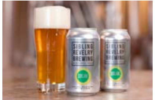
12 oz. Clear Film Label on Silver Can